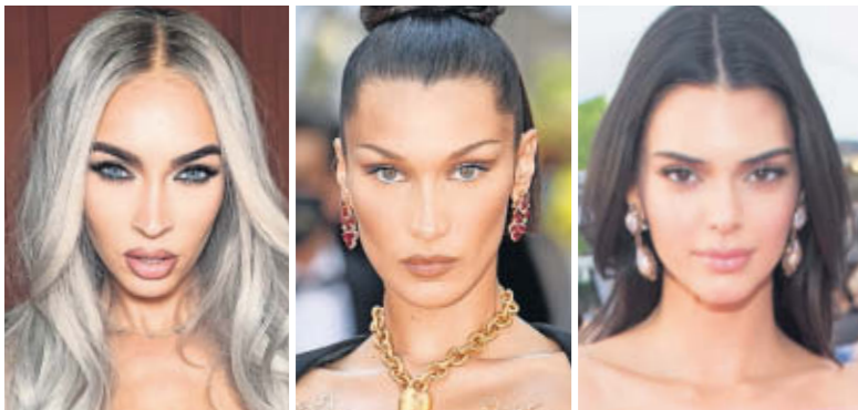
JEEPERS PEEPERS . . . Megan Fox, Bella Hadid and Kendall Jenner inspired fox eye trend

SOFT SIDE: For square faces, soften angles. Layered cuts that start from a gentle side parting work, especially when styled with movement. Actress Andie, 64, with her natural grey, curly locks, is an example. Waved hair, swept over from a side parting, lends softness and symmetry and shows off her cheekbones.