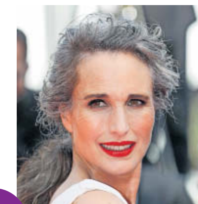
Square Andie MacDowell

MESSY SIDE: Fuller at the forehead, narrower at the chin, a heart face shape suits partings that keep hair close to the face, rather than pulling it back to reveal more forehead. Presenter Emma, 46, often opts for a side parting with hair worn around the face at one side and lifted off at the other. It accentuates her features.