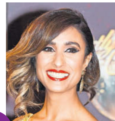
Oblong Anita Rani

SIDE SWEEP: Diamond face shapes like TV's Holly, 41, have a narrow forehead and chin or jawline. A side-swept parting works – as does a slight side-swept fringe, with a bit of a lift at the parting. This gives the illusion of a wider brow and forehead. Avoid fullness around the cheeks and keep texture and movement.