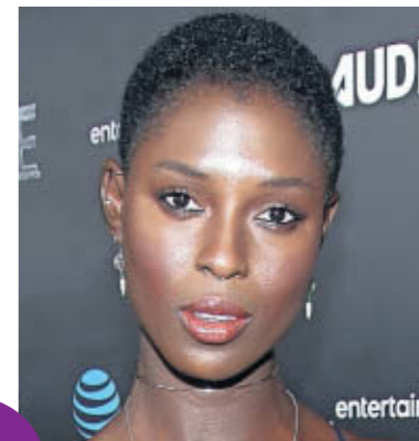
Round Jodie Turner-Smith

NO PARTING: Round faces benefit from styles adding fullness on top to suggest height – a subtle parting slightly lifted, hair tied back or backcombed, or no parting at all like actress Jodie, 35. Avoid flatter styles with dramatic partings as they emphasise the roundness, rather than create the illusion of a more balanced oval.