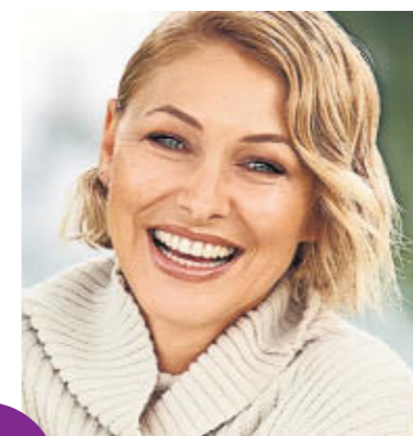
Heart Emma Willis

MIDDLE PART: An oval face's symmetry means any hairstyle will work. It's the shape stylists try to emulate in designing cuts. However the Duchess, 40, has her hair, she looks perfect. This year she has started parting it in the centre more often but her everyday style is fuller and looser which suits her frame.