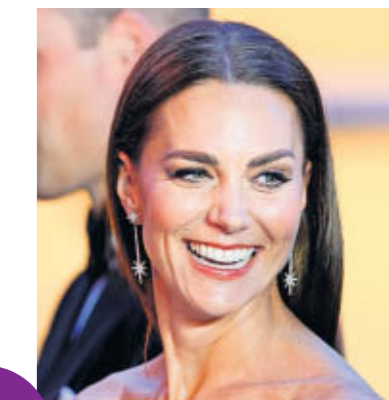
Oval Duchess of Cambridge

DEEP SIDE: Oblong or rectangular faces suit bangs swept at each side of an off-centre parting. It's about balancing the length of the face, to complement it rather than elongate. Radio and TV presenter Anita, 44, knows her angles perfectly and this deep side-parting with fuller waves is perfect for her.